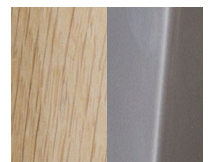
Solid White Oak & Polished Aluminum